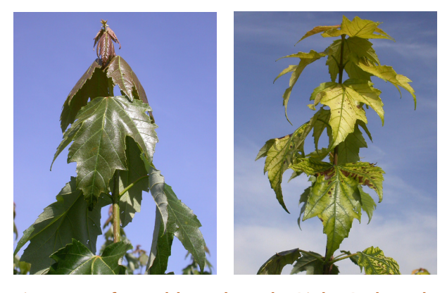
Figure 2. Left: Healthy red maple. Right: Red maple with chlorosis from manganese deficiency. To ensure adequate manganese is available for red maple, the soil pH should be below 5.6 and soil test manganese values should be above 20 ppm. (Photos © Oregon State University. From: Altland, J. 2006. Managing Manganese Deficiency in Nursery Production of Red Maple . EM 8905. Corvallis, OR: Oregon State University Extension Service.)

Details of Mn deficiency, Mn application, and soil pH adjustment can be found in the following publication in the OSU Extension Catalog (http:// extension.oregonstate.edu/catalog/): Managing Manganese Deficiency in Nursery Production of Red Maple (EM 8905).