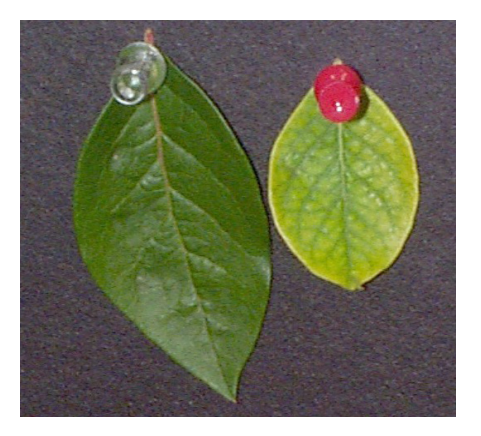
Figure 3. Left: Healthy blueberry leaf. Right: Irondeficient blueberry leaf. Note the pale green leaf area and contrasting green veins on the irondeficient leaf. (Photo © Oregon State University. From: Hart, J., D. Horneck, R. Stevens, N. Bell, and C. Cogger. 2003. Acidifying Soil for Blueberries and Ornamental Plants in the Yard and Garden West of the Cascade Mountain Range in Oregon and Washington. EC 1560. Corvallis, OR: Oregon State University Extension Service.)

Guidance on soil acidification for home gardens and small acreages in western Oregon is provided in the following: Acidifying Soil for Blueberries and Ornamental Plants in the Yard and Garden West of the Cascade Mountain Range in Oregon and Washington (EC 1560); Acidifying Soil in Landscapes and Gardens East of the Cascades (EC 1585). For large scale agricultural production, guidance about soil acidification can be found in the following: Acidifying Soil for Crop Production West of the Cascade Mountains (EM 8857); Acidifying Soil for Crop Production: Inland Pacific Northwest (PNW 599). All available in the OSU Extension Catalog (http://extension. oregonstate.edu/catalog/).