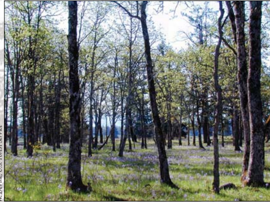
W. Devine, U.S. Forest Service

Decades of fire suppression have created conditions largely inhospitable to oaks. Oak communities, which are fire-tolerant and slow-growing, are increasingly being overtopped and shaded out by faster-growing conifers, which were historically controlled by fire. Without abundant sunlight, oaks and the other shade-intolerant plant species found in oak communities eventually die.