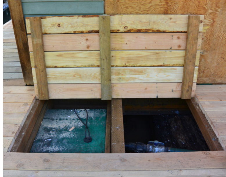
covered honey pot

typically made of fiberglass or steel. Steel honey pots will rust and leak over time and should be replaced with a plastic model as soon as possible. Ideally, you'll find an access panel to the honey pot on the deck. Most honey pots employ a pump to send sewage from the pot to the sewer line and the pump needs regular servicing. Replacing the honey pot and pump may be required every five years or so and can cost upwards of $600.