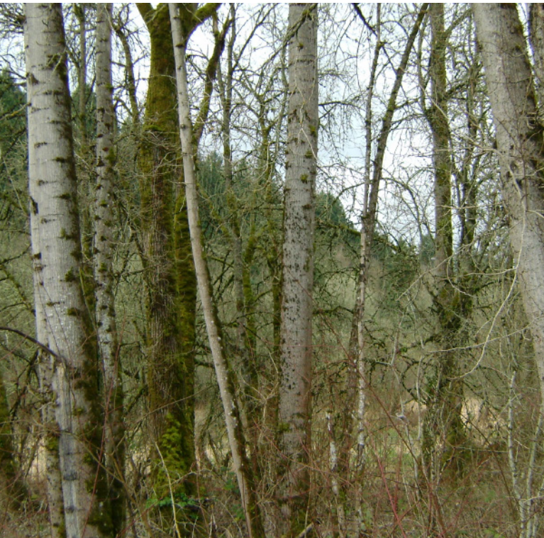
Black cottonwood forest

In higher riparian or upland areas, Oregon white oak is of particular interest because it is an important piece of our heritage and wildlife habitat, and is increasingly rare. Other upland tree options include Willamette Valley Ponderosa pine—which co-habitates well with Oregon oak, bitter cherry—frequented by cedar waxwings—and the small cascara tree. Some popular and suitable native upland shrubs are red-flowering currant, Nootka rose, serviceberry, mock orange, and Oregon grape. Snowberry is particularly useful to imperiled native bees because it blooms into late summer when few native species are still blooming. Native willows on the other hand, provide good early season forage (flowers) for bees and hummingbirds.