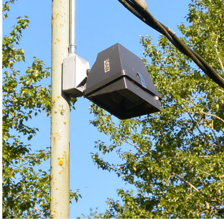
a downward-facing light on the dock

Wakes can seriously erode and degrade the banks of rivers and other water bodies, as well as cause damage to moored structures. Wakes also create water turbulence and