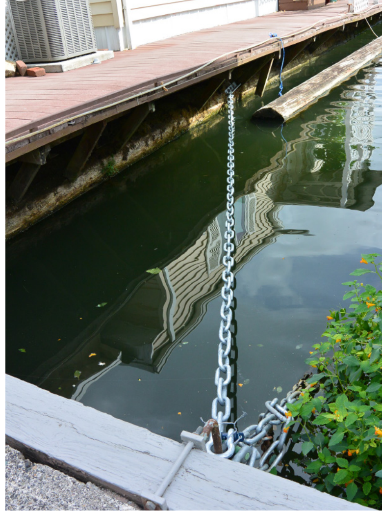
mooring connection of galvanized chains

Floating homes are generally moored along docks; recommended attachments are rigid standoffs or galvanized chains. This allows homes to rise and fall with water levels, putting less stress on moorage docks and home mounting points. Utility lines for gas and power, phone, sewer and water are typically suspended from the underside of docks and connected to each home. These lines should be checked regularly by residents and managers for leaks or maintenance issues. In addition to protecting the environment, regular preventive maintenance can reduce utility costs and avoid larger, more expensive problems.