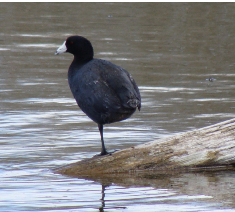
American coot

Eagles, herons, and osprey are also seen near moorages. They particularly benefit from tall and dead trees for perching and nesting. Keep or plant trees like cottonwoods along the shoreline and in nearby locations that don't pose a hazard to human infrastructure.