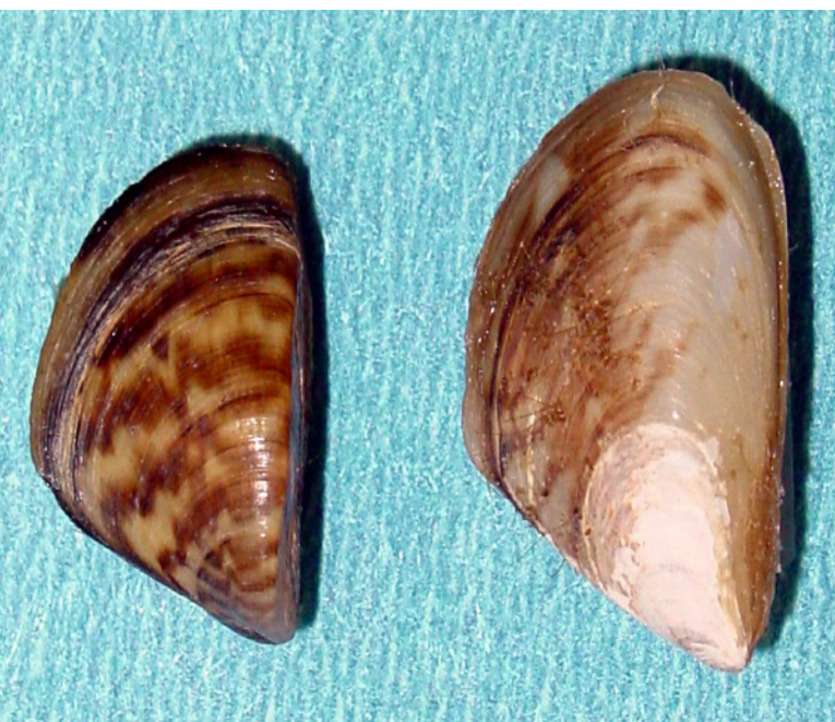
Zebra mussel (left) and Quagga mussel (right)

Zebra or quagga mussels, which adhere to submerged natural and man-made surfaces can destroy boat motors and aquatic ecosystems, are not yet established in Oregon. Statewide efforts are underway to keep them out of Oregon. The Oregon State Marine Board has a website to help identify aquatic invasive species and learn how to prevent their spread: oregon.gov/OSMB/boater-info/Pages/Aquatic-Invasive-Species-Program.aspx . In addition, the US Department of Fish & Wildlife has many helpful publications found at protectyourwaters.net .