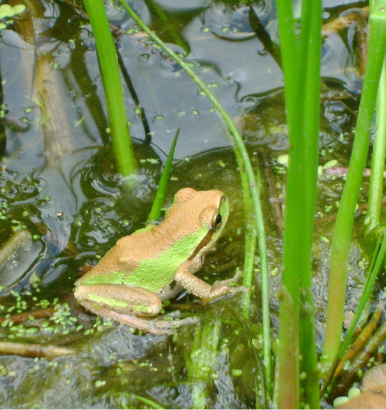
Pacific tree frog

year. Motorists driving Marine Drive and Harborton Road are encouraged to slow down as volunteers help the amphibians across the road to safety. If you have ponds or wetlands, you can install shoreline vegetation and add branches to the water. Protecting or enhancing nearby woods gives frogs and salamanders a safe place to overwinter and thrive as adults.