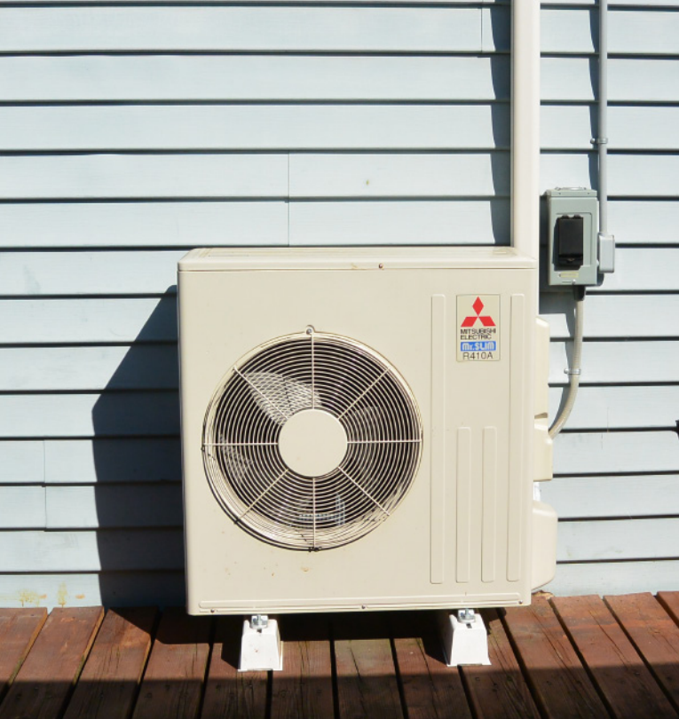
heat pump system—outside photo courtesy of Pat Welle

the home. Homeowners are asked to be mindful of noise pollution and modify or replace older heating and cooling systems if they are noisy and annoying to neighbors.