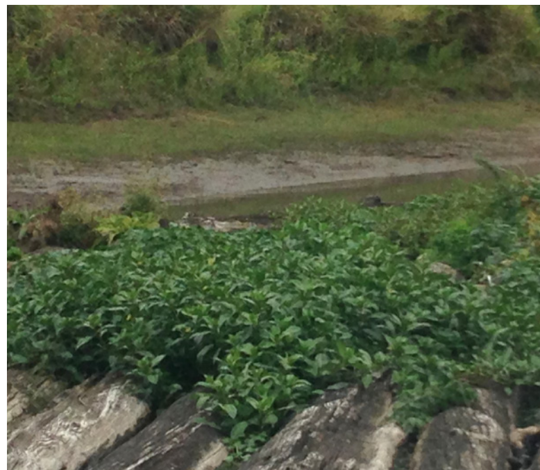
Ludwigia on raft

Information on each of the worst local invasive weeds, including those on the