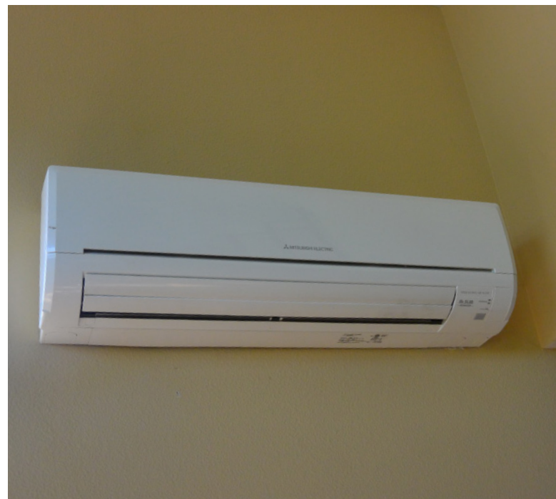
heat pump system—inside photo courtesy of Pat Welle

Heating and Cooling Systems: The systems for floating homes are similar to those for land-based homes. Geothermal can be a good option, and split-system heat pumps are gaining in popularity because they allow the user to direct heat to specific areas of