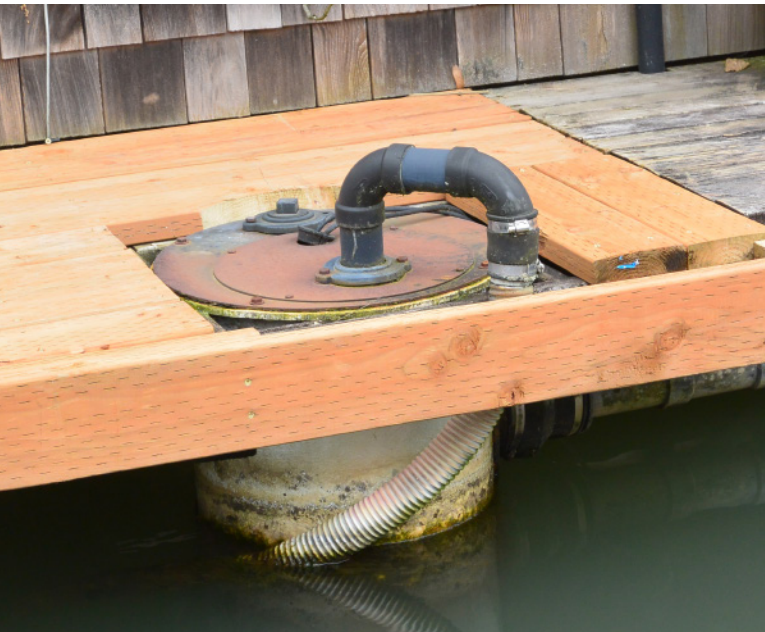
uncovered honey pot

Honey pots, usually located under the home deck near the dock end of the structure, are