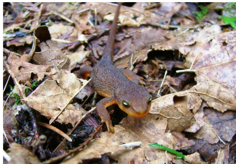
Rough skinned newt

Frogs and salamanders: Several of our local native species breed in wetlands and attach their eggs to emergent vegetation. Long-toed salamanders also use tiny willow branches that dip into the water. An effort was started three years ago to assist the population of red-legged frogs—a sensitive species—that travel from above Harborton Road, across Hwy 30, and into the wetlands just upstream of Fred's Marina and then back to the forest. Migration of these frogs plus chorus, or tree frogs, and long-toed and northwestern salamanders occurs between December and March each