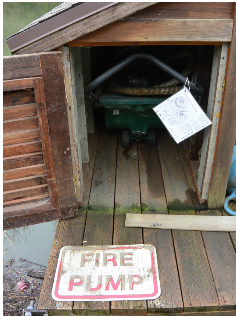
fire pump house

Marinas have fire pump stations located at critical locations along their docks. Homeowners should be familiar with the nearest station and the operation of all fire safety equipment, in accordance with instructions from your local fire jurisdiction.