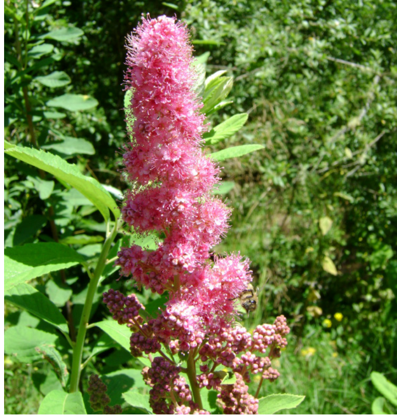
Douglas spirea

and eagle nests), red alder, and a number of smaller native trees and shrubs. Red osier dogwood and various willow species (such as Pacific, Sitka and Scouler) are easy to establish and helpful for stemming soil erosion. Local native plant nurseries often can provide live stake cuttings, which are harvested locally and particularly suited to riverbank or wetland planting. Also appropriate are pacific ninebark, Douglas spirea, swamp (or clustered) rose, salmonberry, elderberry, Western crabapple, Douglas hawthorne (as opposed to the invasive English hawthorne), and native chokecherry.