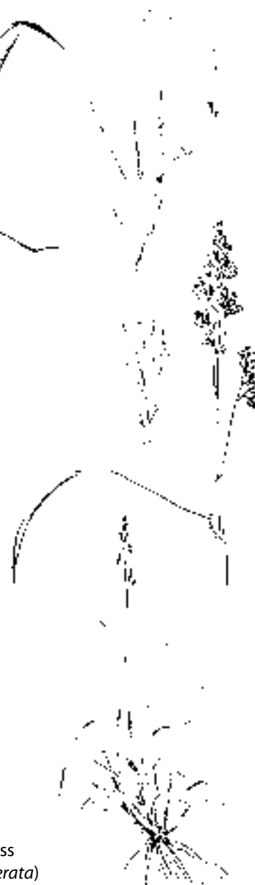
Orchardgrass ( Dactylis glomerata )