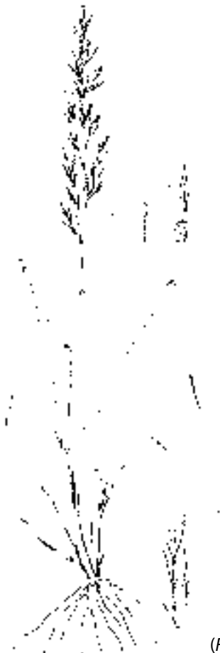
Tall fescue ( Festuca arundinacea )