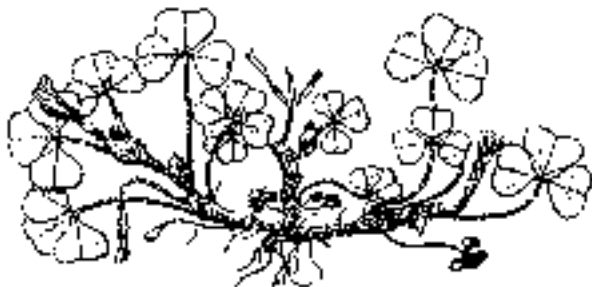
Subterranean clover ( Trifolium subterraneum )