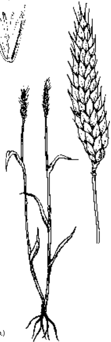
Triticale ( Triticosecale spp. )