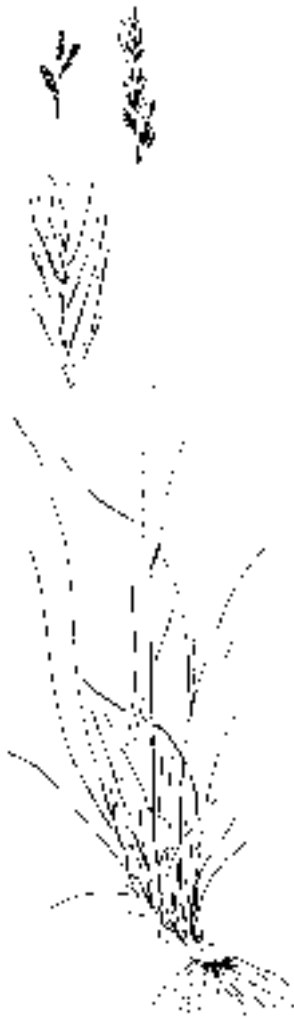
Red fescue ( Festuca rubra )