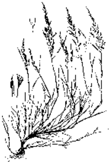
Colonial bentgrass (top) Creeping bentgrass ( Agrostis spp.)