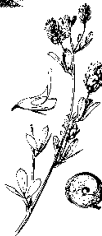
Alfalfa ( Medicago sativa )