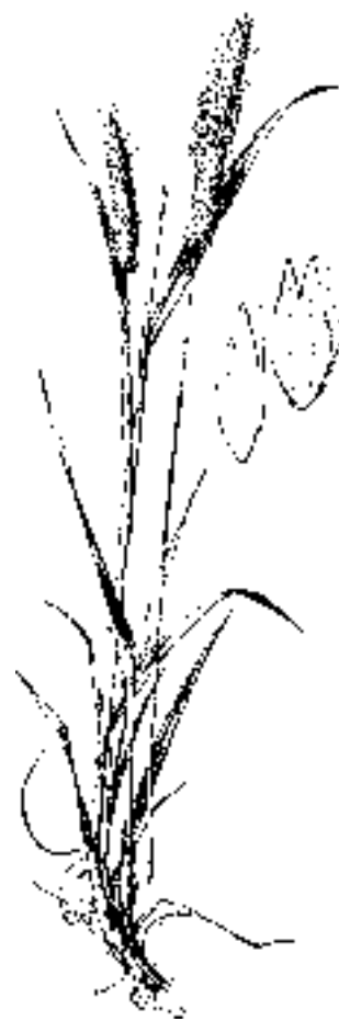
Foxtail, Meadow ( Alopecurus pratensis )