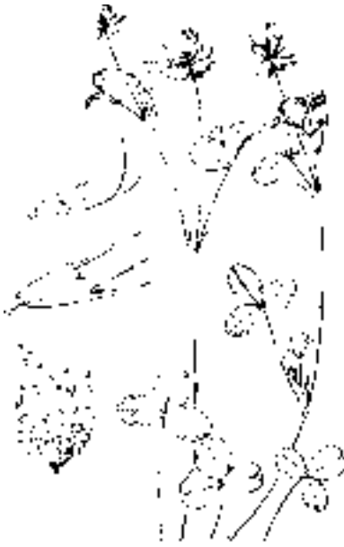
Alsike clover ( Trifolium hybridum )