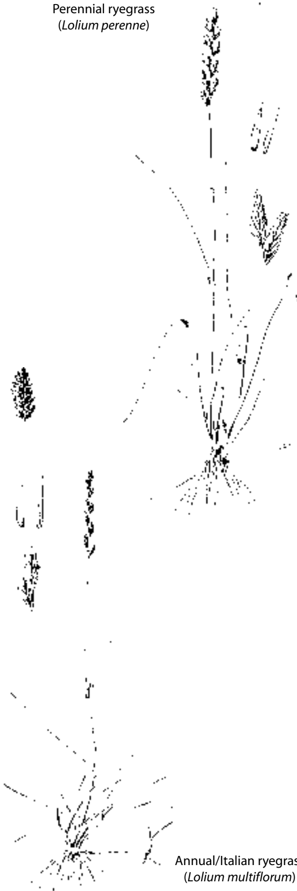
Annual/Italian ryegrass ( Lolium multiflorum )