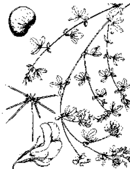
Birdsfoot trefoil ( Lotus corniculatus )