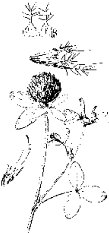
Red clover ( Trifolium pratense )