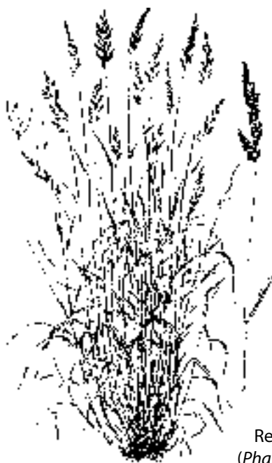
Reed canarygrass ( Phalaris arundinacea )