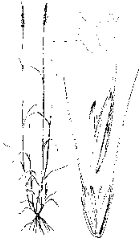
Wheat ( Triticum vulgare )