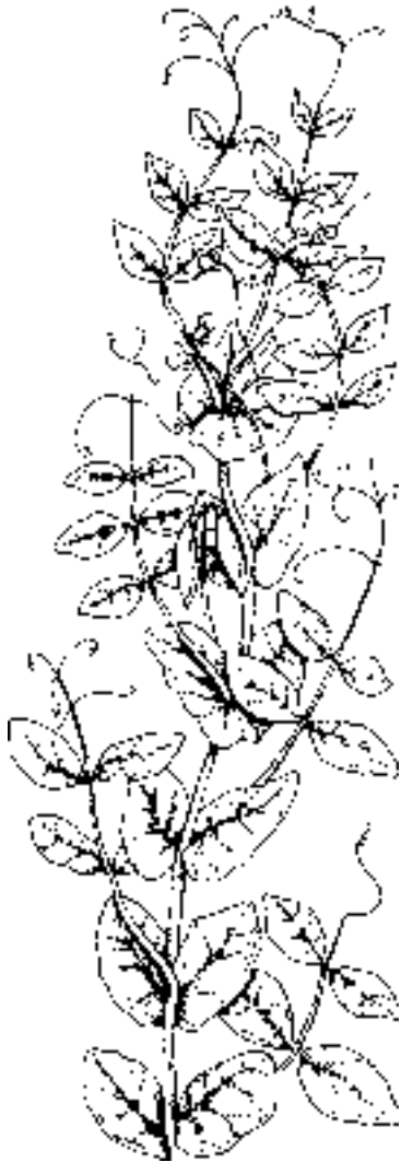
Austrian winter peas ( Pisum sativum arvense )