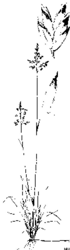
Kentucky bluegrass ( Poa pratensis )