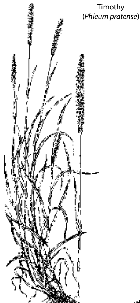
Timothy ( Phleum pratense )