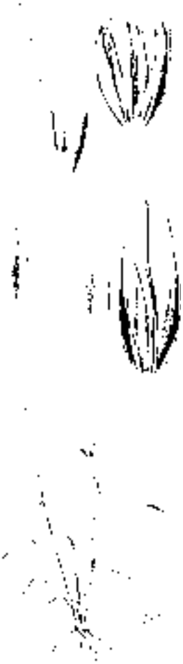
Barley ( Hordeum vulgare )