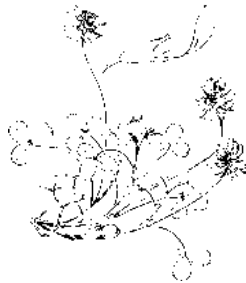
White clover ( Trifolium repens )