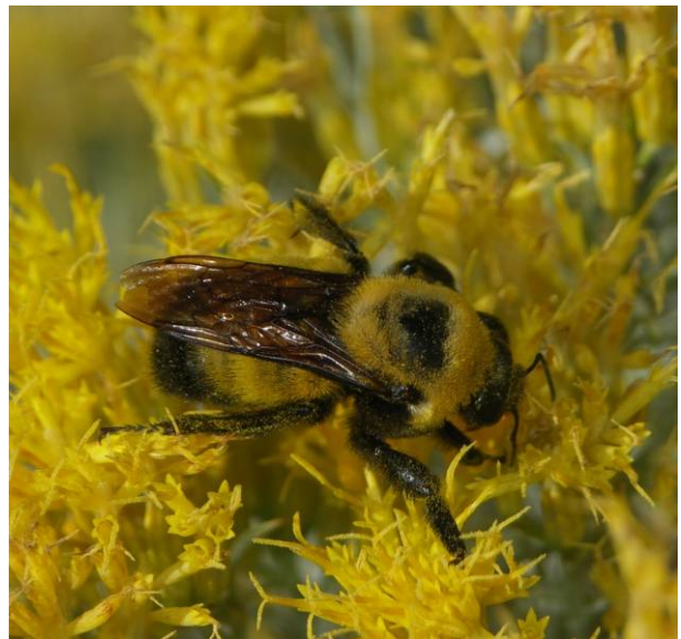
Right – bumble bee on rabbit brush (Vaughan)

The purpose of this technical note is to provide information about establishing, maintaining and enhancing habitat and food resources for native pollinators, particularly for native bees, in Riparian buffers, Windbreaks, Hedgerows, Alley cropping, Field borders, Filter strips, Waterways, Range plantings and other NRCS practices. We welcome your comments for improving any of the content of this publication for future editions. Please contact us!